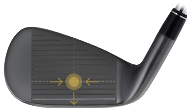
#6 - PW

Structure that realizes an improved consistency and confidence